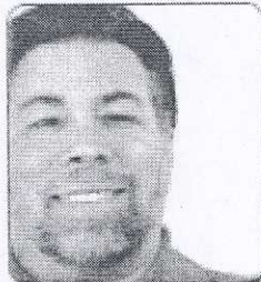
Steve Wozniak, Apple co-founder and current President and CTO World of Zeus.